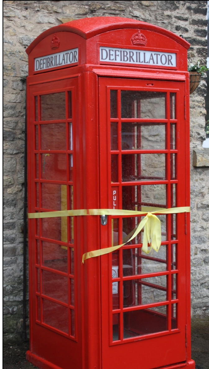
Brompton-by-Sawdon's cPAD GBCT's first project—2015

We work hard to ensure young people can make the most of their lives and that no life is wasted.