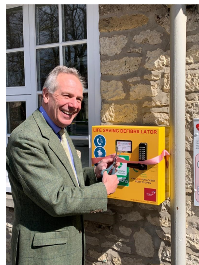
Opening of the Hovingham Community Defibrillator in April 2019 —article p. 3.