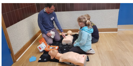
CLGB training with their new GBCT supported training defibrillator

The GBCT supported public access defibrillator in Hovingham in North Yorkshire was officially opened in April 2019 by local resident Sir William Worsley, Lord Lieutenant of North Yorkshire (photo front page, top).