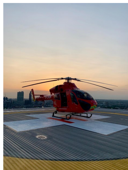
London Air Ambulance at base during MRT and GBCT visit—article p.3.